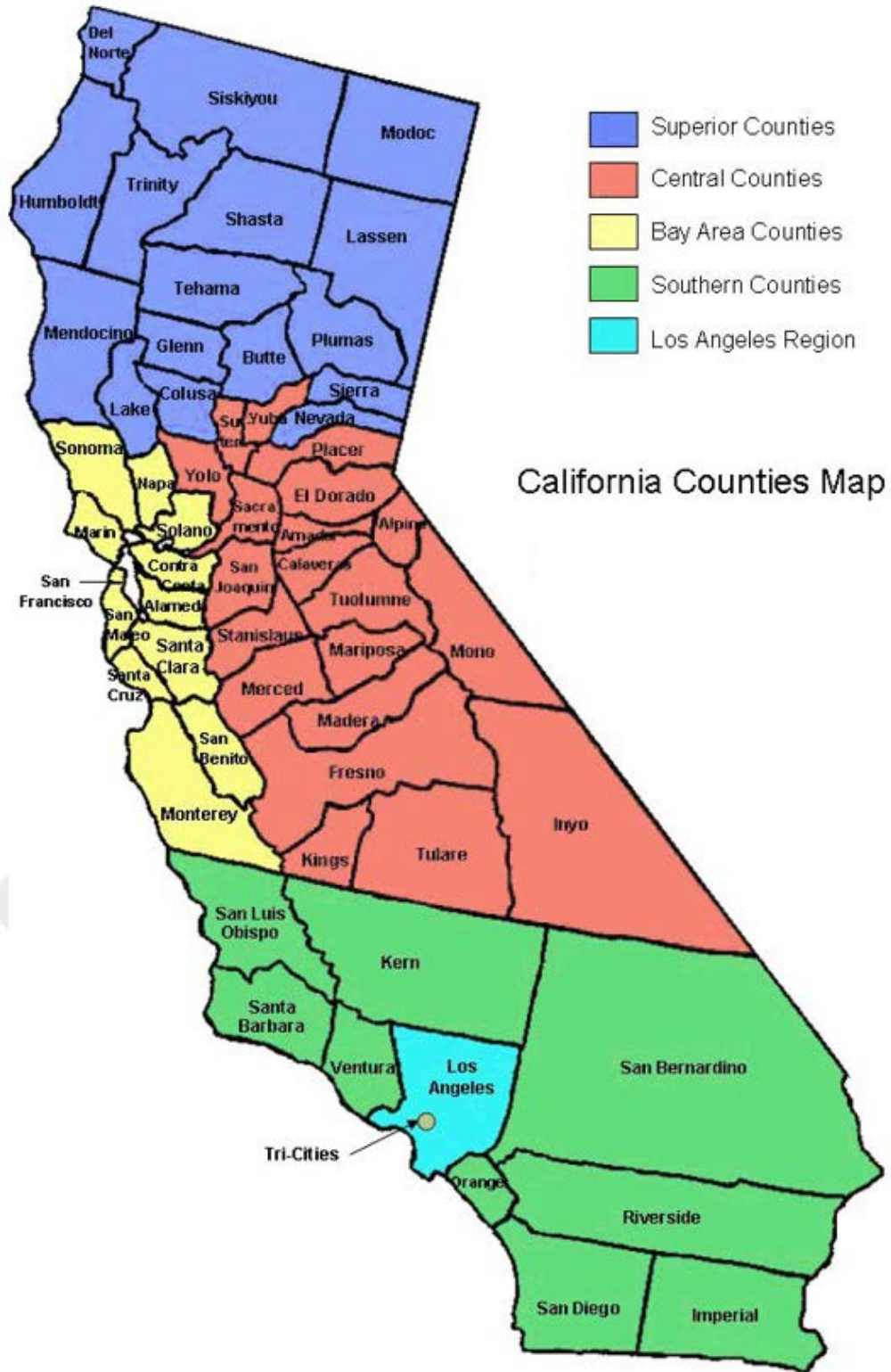
California Counties Map